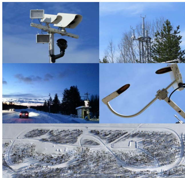
Fig. 2. Test track equipped with testing infrastructure

The Sod5G test track http://sod5g.fmi.fi is composed of a 5G-test network working at 2.3 GHz band [8]. It is based on LTE-A hardware and connected to 5GTN. The Sod5G test track also supports vehicle test network IEEE 802.11p and it also has a road weather infrastructure (2 RWS). The Sod5G versatile vehicle winter testing track has a 1.7 km main track (gravel/concrete) as presented in the Fig. 2.